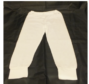
Clothing for older children

The decision as to which group your child will be allocated to will be done randomly by a computer and they will have an equal chance of being in either group. You will be sent a letter from the unit who are running the study, soon after your first visit with the nurse, that outlines what group your child is in and what to do next.