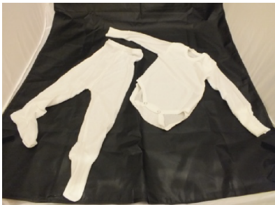
Clothing for babies / infants

In order to find out if silk clothing (bodysuits, leggings and vests) alongside normal eczema treatment is effective in the long term management of children with eczema, the children in this study will be split into two groups: one group will wear the clothing from the onset of their participation in the study, the other group will continue with their normal eczema treatment.