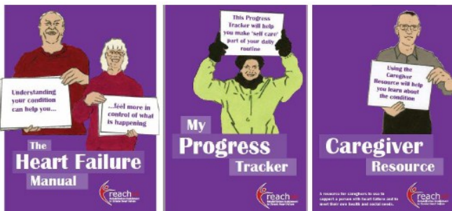
The REACH-HF Manuals: The Heart Failure Manual, Progress Tracker and Caregiver Resource

The manual is being tested in the feasibility study and has also been sent to several individuals and organisations for review, including the Cardiovascular Care Partnership, British Heart Foundation, Cardiomyopathy Association and Cardiovascular section of the British Geriatrics Society.