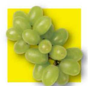
1 handful of grapes