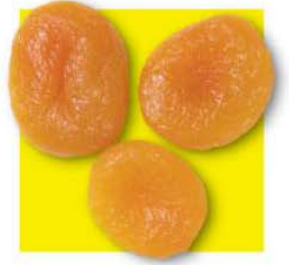
3 whole dried apricots