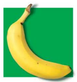
1 medium banana