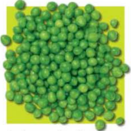
3 heaped tablespoons of peas